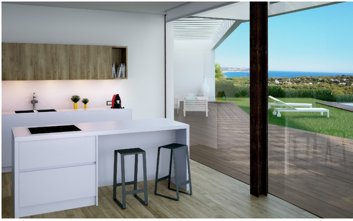
Planta Baja | Ground Floor